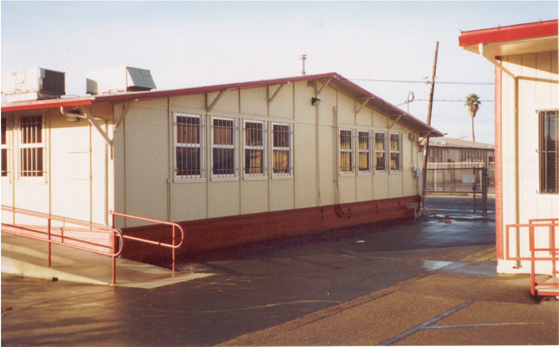
Figure 4: Side of Main Building