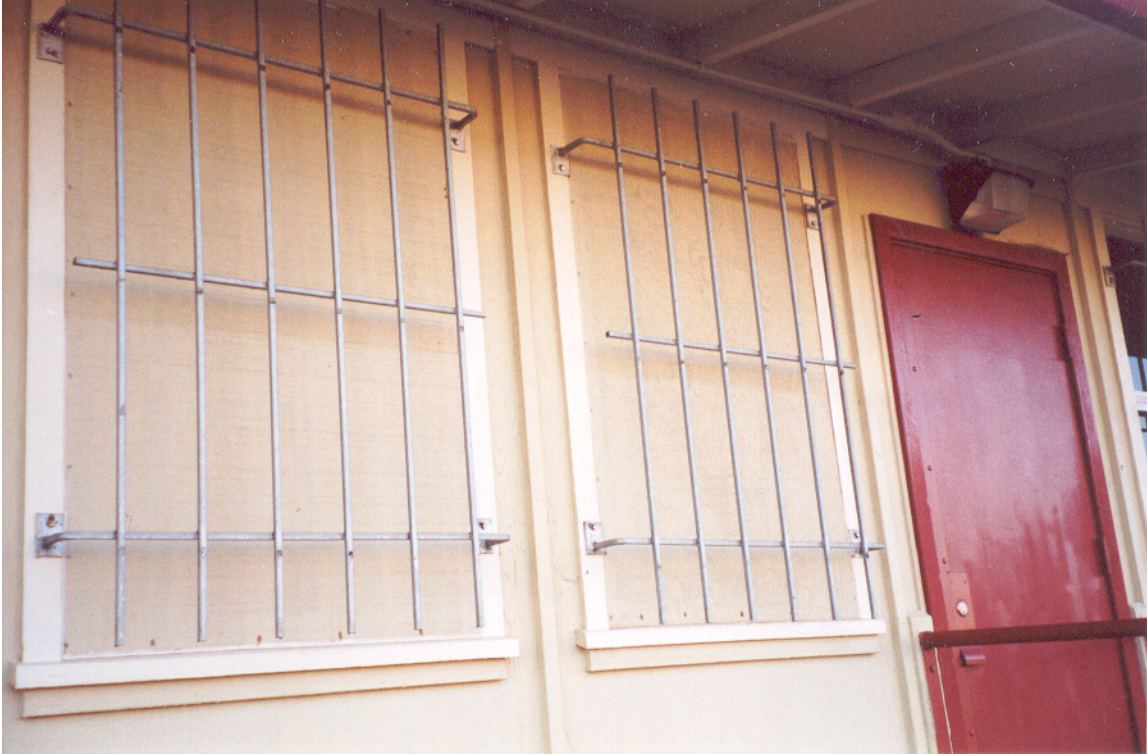
Figure 3: Plywood Window Infill at Front of Main Building