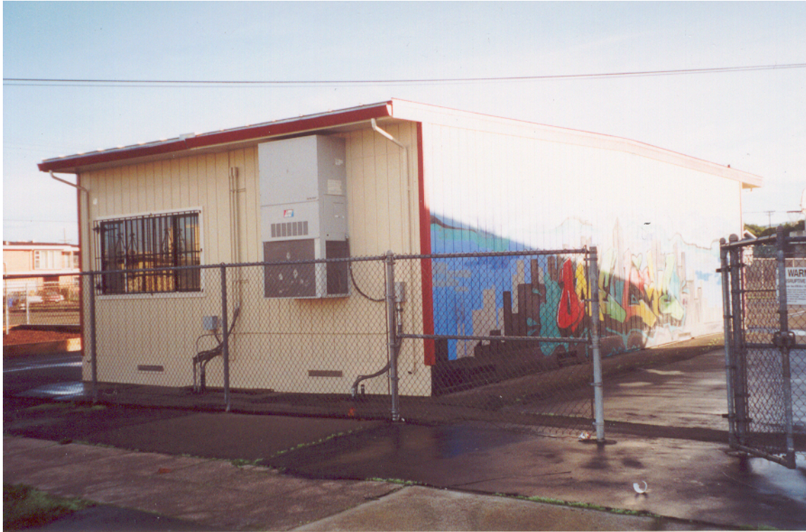
Figure 8: Side and Rear of Classroom Portable