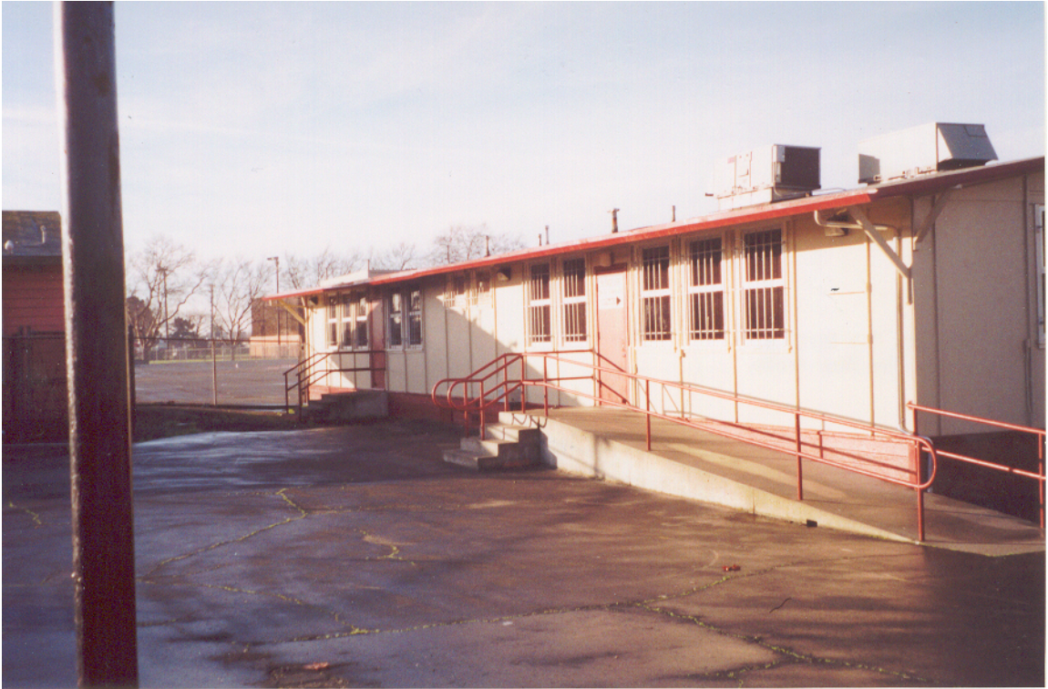
Figure 5: Rear of Main Building