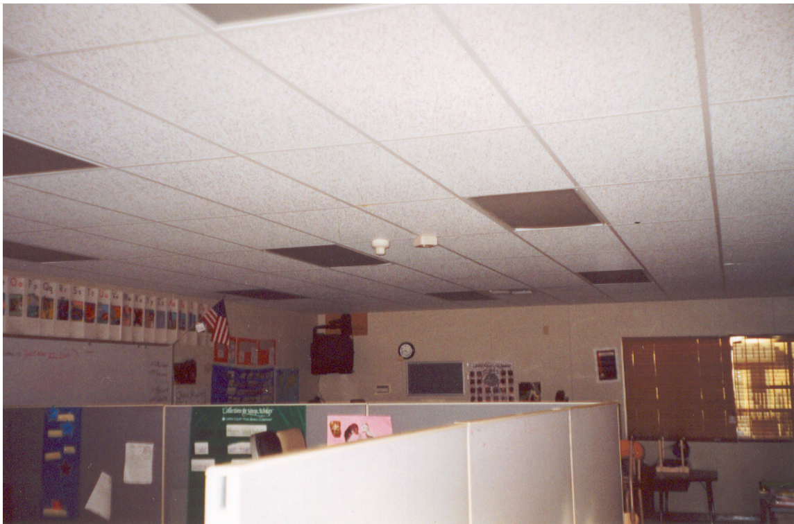
Figure 9: Interior of Classroom Portable