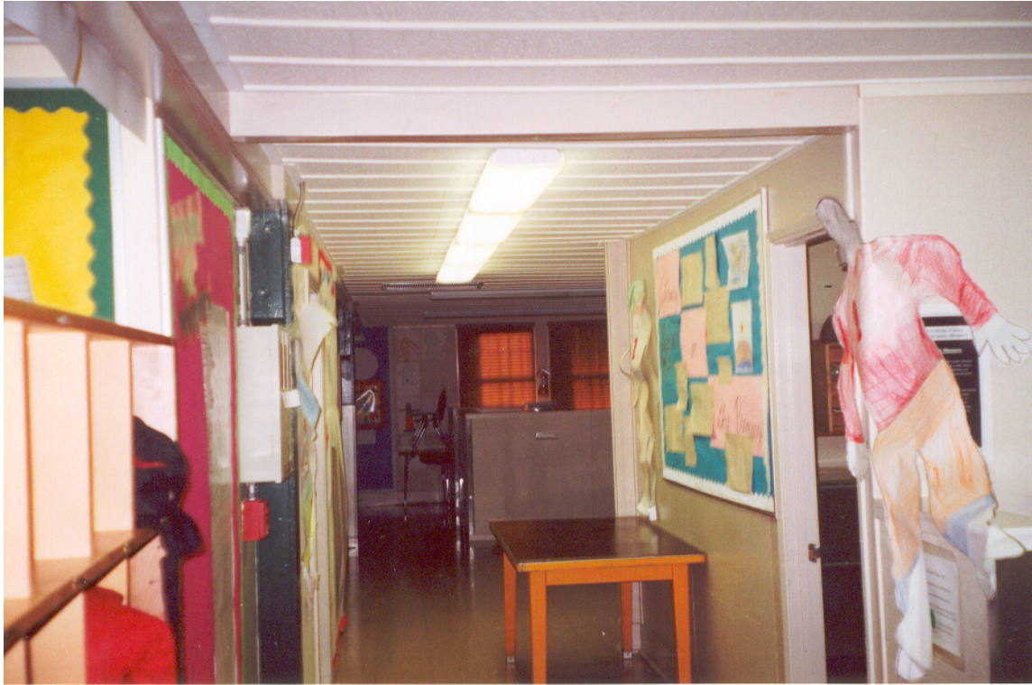
Figure 6: Interior of Main Building