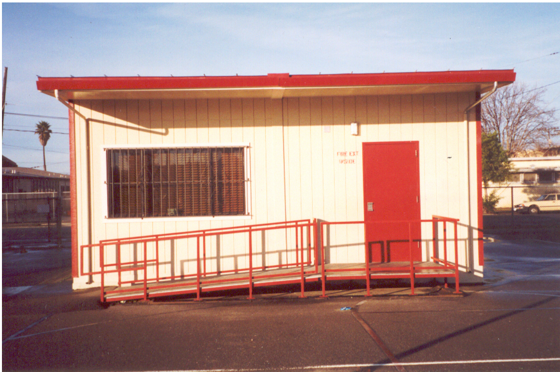
Figure 7: Front of Classroom Portable