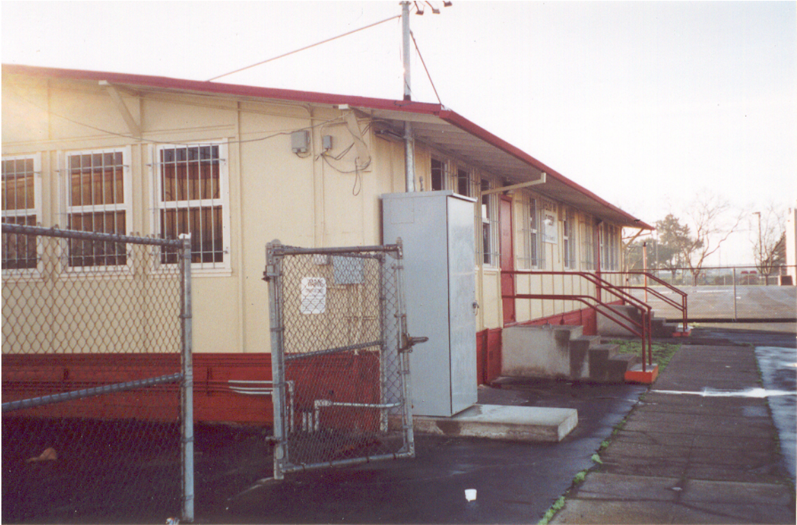
Figure 2: Front and Side of Main Building